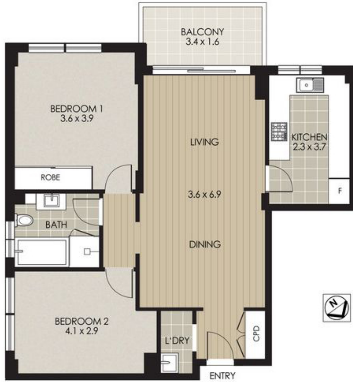
APARTMENT FLOOR PLAN