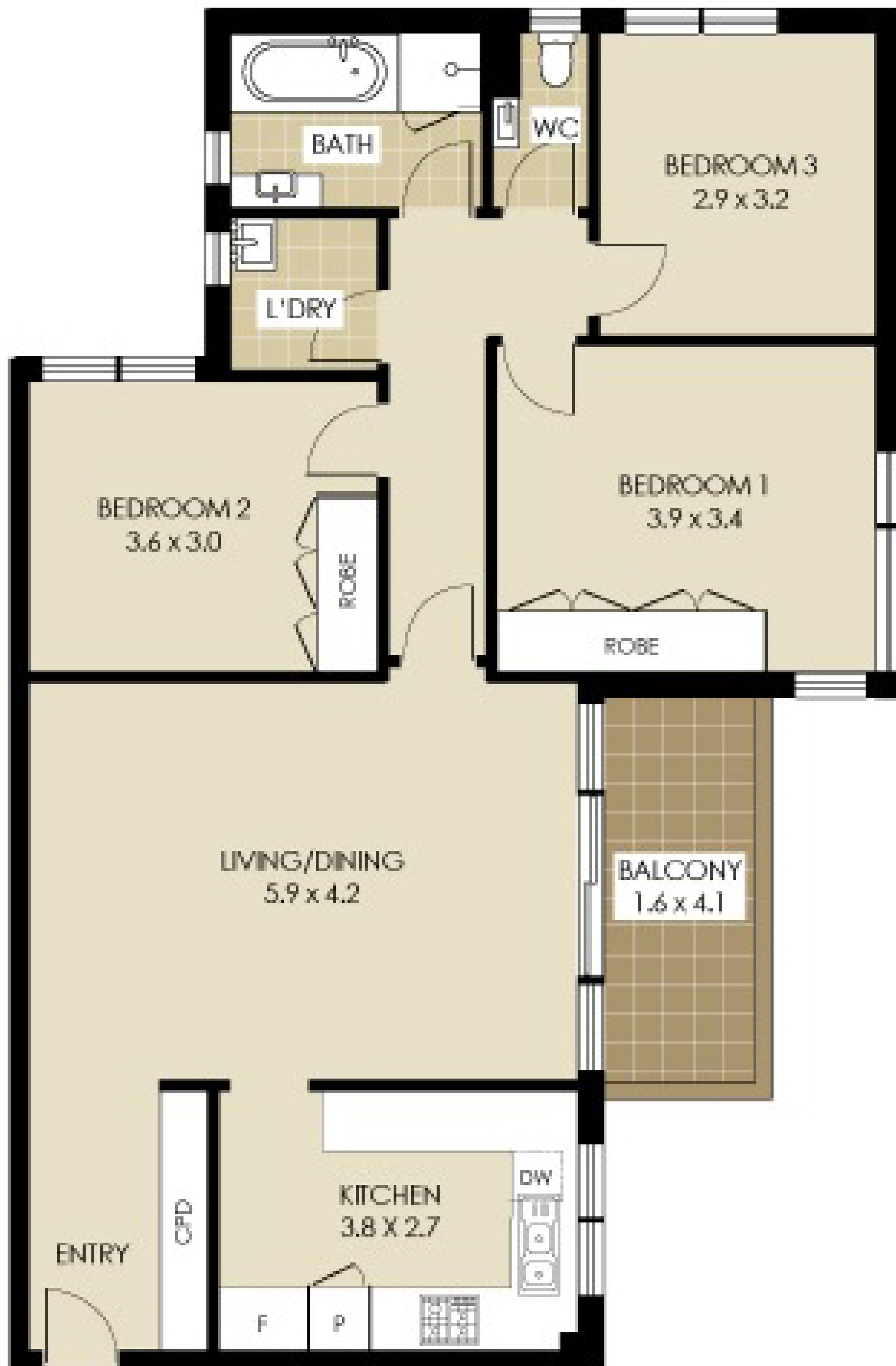
APARTMENT FLOOR PLAN

APARTMENT FLOOR AREA = 106.4m 2 approx. (INCLUDING BALCONY) GARAGE AREA = 18.2m 2 approx. STORAGE AREA = 3.9m 2 approx. TOTAL AREA ON TITLE = 128.5m 2 approx.